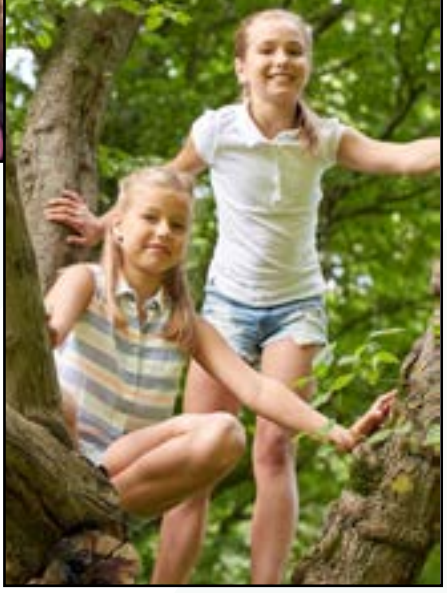
New-Mac offers a school safety program to schools in our service area (above). Below, we encourage kids to get out and play but always look up before climbing. (At left) Your coop attends many school functions to teach safety.

Safety program to all the elementary schools in our service area along with 4-H clubs, scout troops and home school groups.